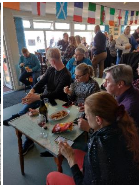
Pebble Beach Pub Golf Rules At PYC