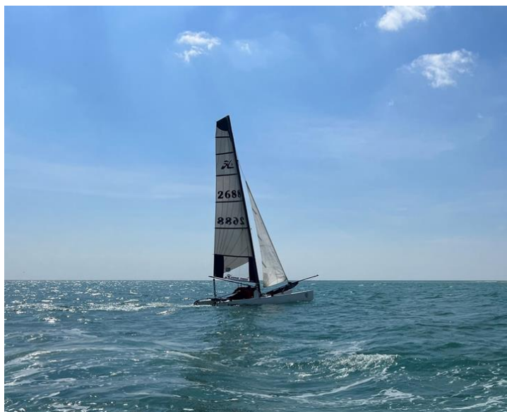
Commodore Cup Races 1 & 2