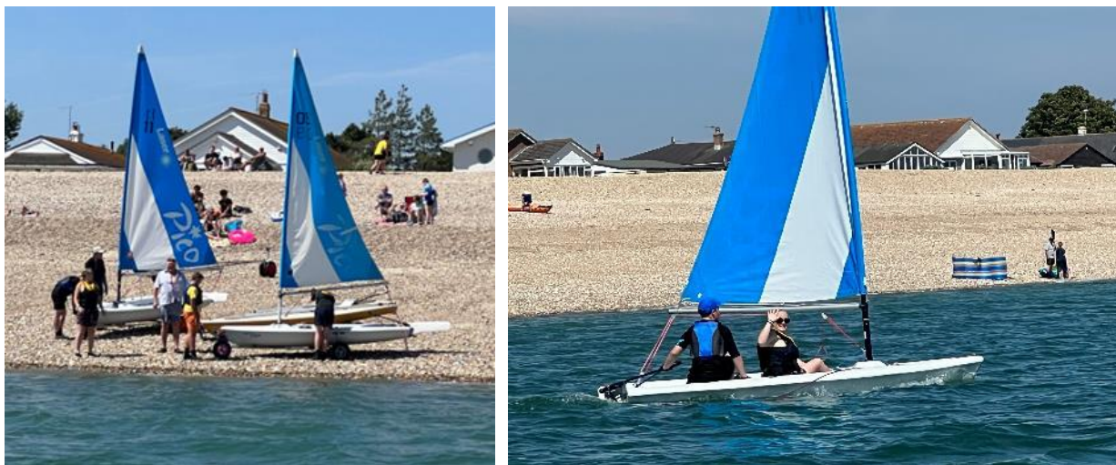
Sunday saw eight boats rigged and ready to sail races 3 and 4 of the Summer series, the Commodore Champagne Challenge.