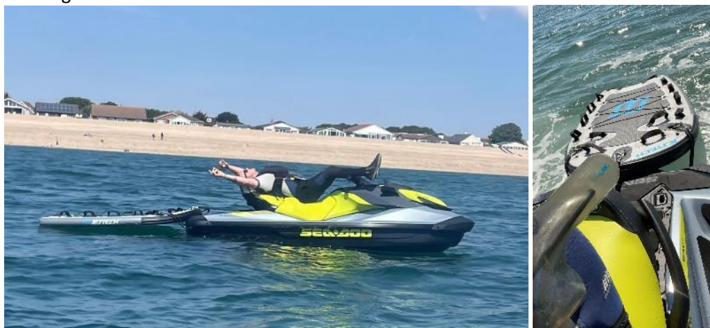
This is the our Sea-Doo with the new safety cover on the recently purchased lifeguard which we can now tow behind the rescue boat with a body on board to prevent any capsizing during lifesaving. Sorry about Bailey posing for the photo - he was having too much fun! We'll stop that!!!!