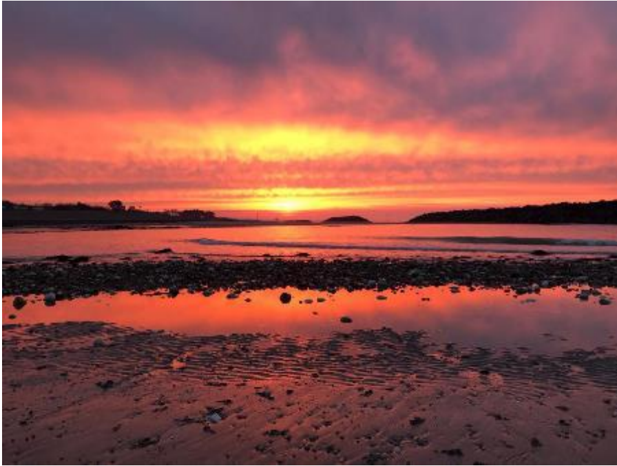
6am sunrise on the Paghham beach.