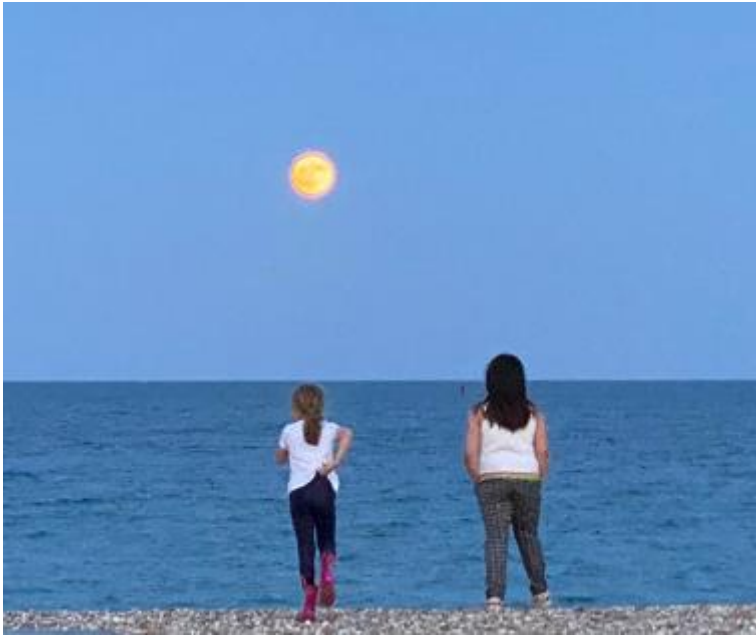
Saturday evening outside the Club.