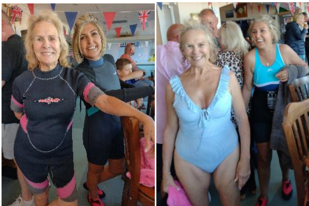
The Before and After photos!