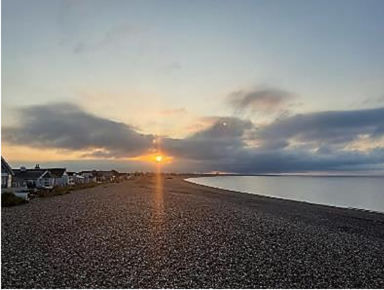
Mid summer's day at dawn.