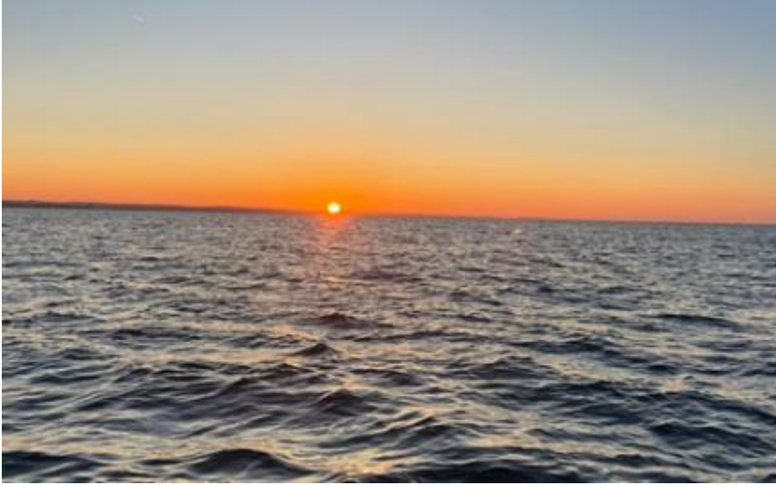
Early Monday morning and the sun rise over the sea at Pagham.