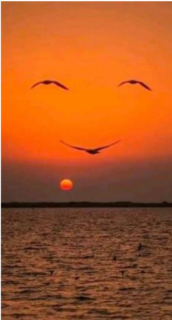
What a stunning photo by one of our members, Clive! Amazing!