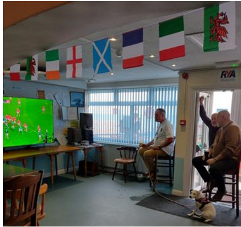
and then after.....